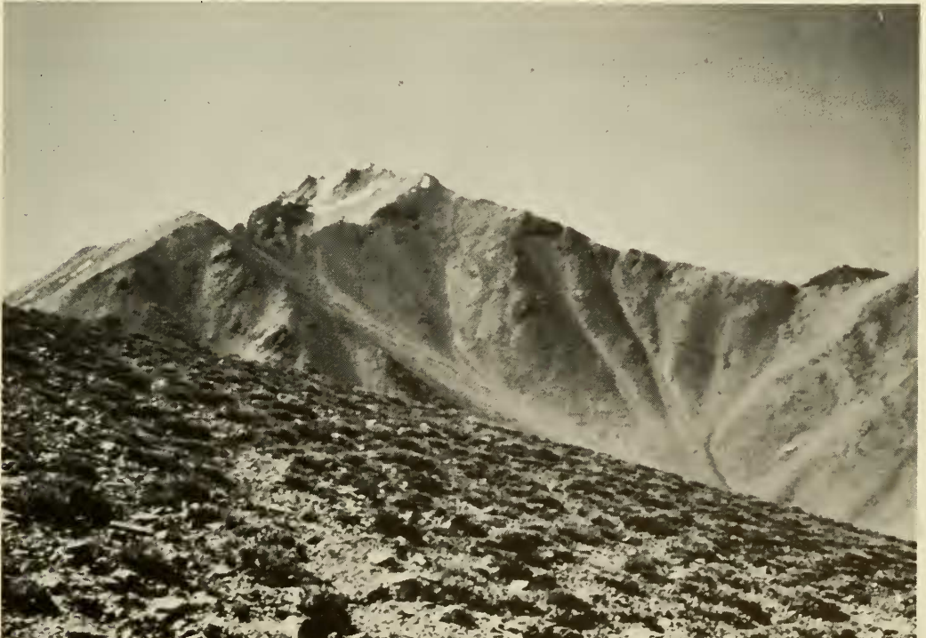
Fig. 2. Alpine Biome. Foreground with typical mat vegetation. Esmeralda County: Summit of Boundary Peak in background.

In all zones of all three subdivisions mountain streams are bordered by aspen,